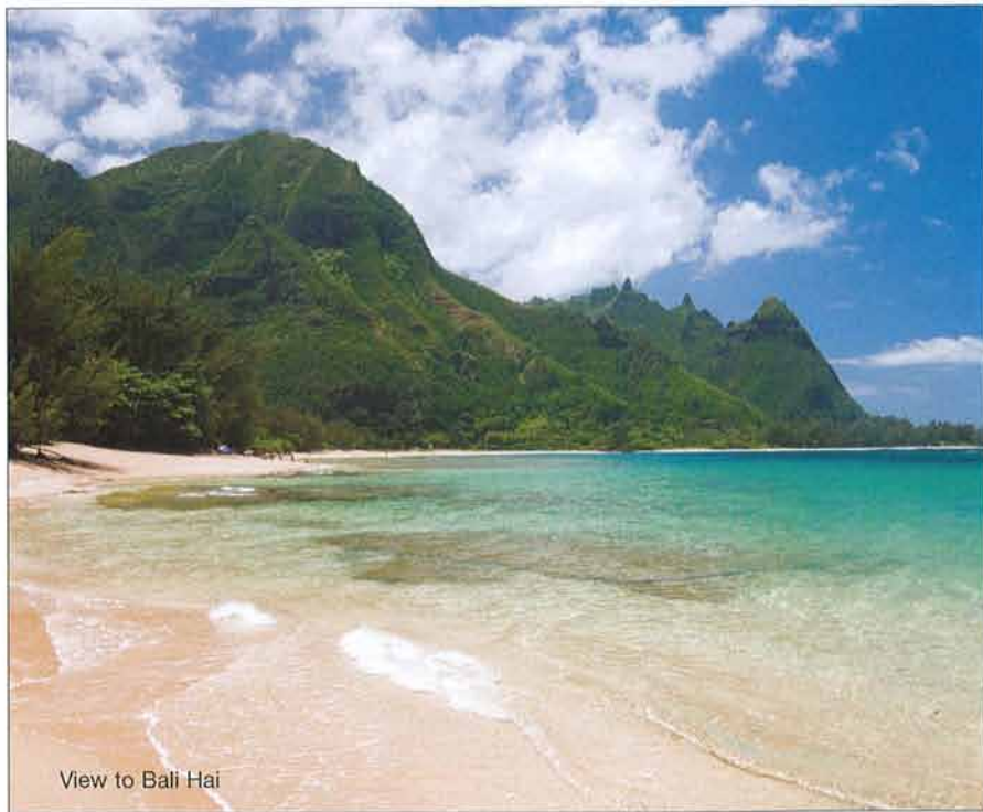
View to Bali Hai